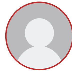
Jason Switzer, EQUITABLE ORIGIN