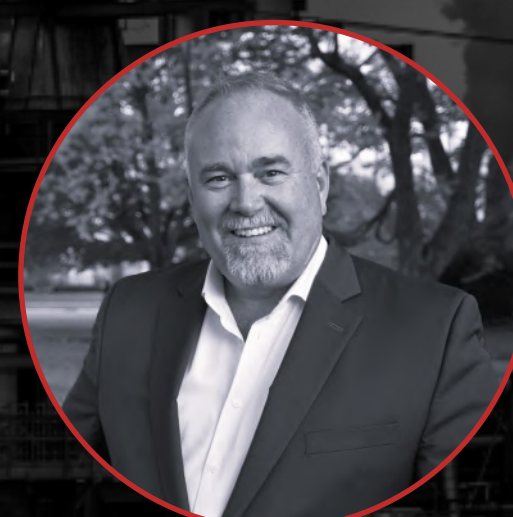
Hon. Todd Smith Minister of Energy GOVERNMENT OF ONTARIO