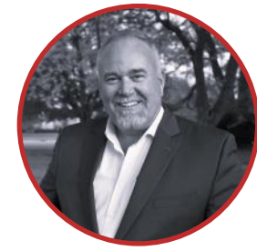
Hon. Todd Smith, Minister of Energy, GOVERNMENT OF ONTARIO