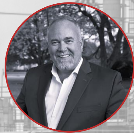
Todd Smith, Minister of Energy GOVERNMENT OF ONTARIO